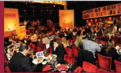
FORWARD Closing Ceremony