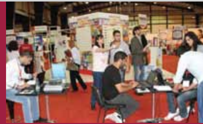
FORWARD Exhibiting Area