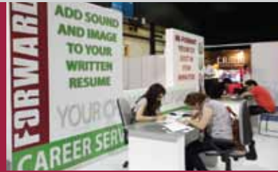
Career Services Pavilion